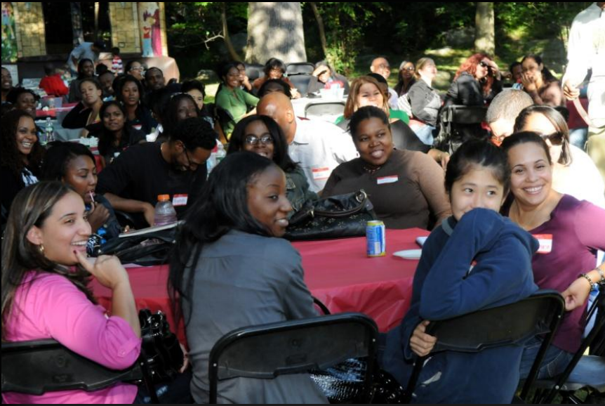
Students share a laugh at the Back-to-School BBQ. (Upper, Right)