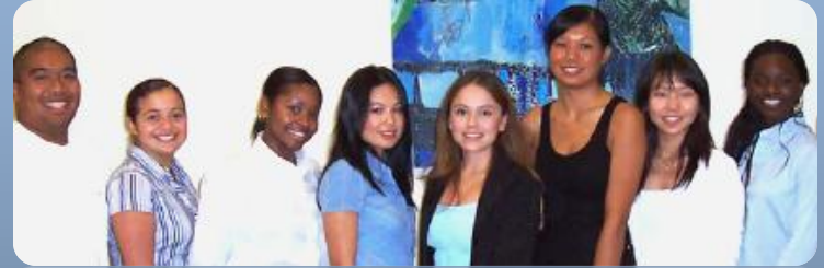
Past Southern California Interns

Apply on-line or download an application from our website: www.healthcareers.org Applications due February 16, 2009 at 11:59 PM EST